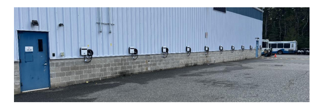
The first wave of EV chargers have been installed at Ops!

Hyannis Transportation Center has had electric vehicle chargers for years <u>these are open to the public!</u>), and now CCRTA has installed 10 EV chargers at our Operations Depot Using existing, previously unused electrical panels, we installed 10, 48 Amp Level 2 chargers along the outside wall of our bus service bays. Now our Operations Depot is ready to charge future EVs.