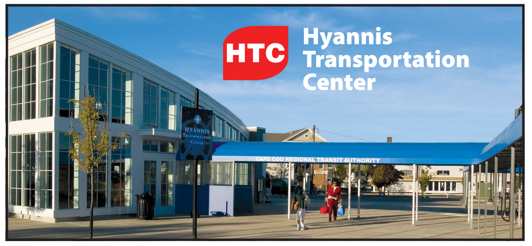
Pick-up/drop-off area located at Main and Center Street.